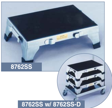
Bracing below the bottom step offers extra reinforcement.

MODEL 8762SS (EZ STACKING) STOOL provides a real storage solution, while also locking side-to-side or end-to-end to create a larger stool or platform. Rock solid and versatile. Constructed from stainless steel with rubber treading on the platform and rubber tips on the feet. Designed for surgery suites, diagnostic centers, outpatient facilities, and exam rooms.