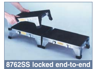
8762SS locked end-to-end

Add the optional dolly 8762SS-D for easy transportability.